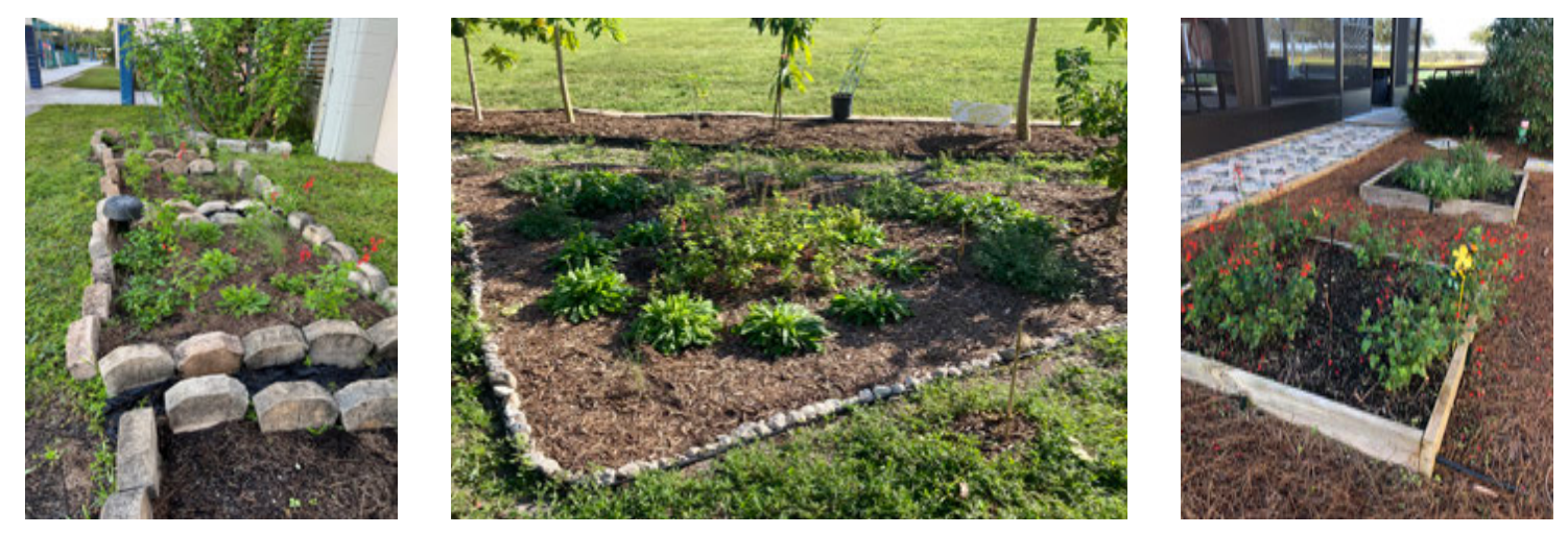
Left to right: Lakeside Elementary, Marjory Stoneman Douglas High School and Round Lake Charter School

Some garden sites were small plots in school courtyards and some were grow boxes while others were an expansion of dedicated outdoor learning spaces. Ten ground plots were less than 100 square feet and 13 were greater than 100 square feet. Seven were grow boxes. About half of the gardens received more than six hours per day of full sun. Almost half were reported to be occasionally moist, while the rest required some irrigation.