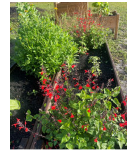
Seaside Charter School North Campus

Students learned about different Florida native plants and how beneficial they are to pollinators. They learned about different pollinators and identified them in our garden, and learned how environmental factors play a key role in the survival of both native plants and pollinators.