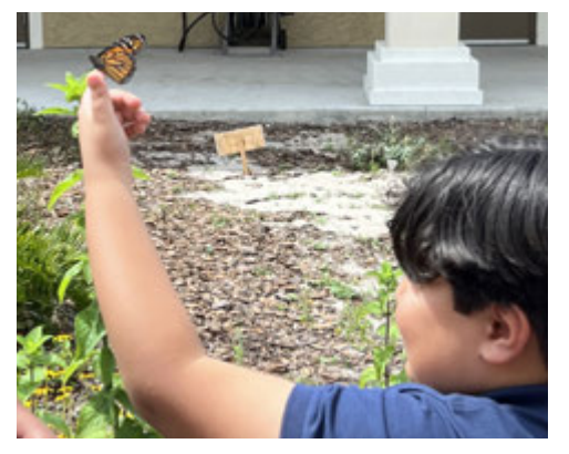
St. Peter Catholic School