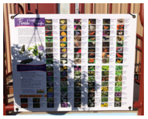
Round Lake Charter School

We had a wonderful garden experience and have attracted so many pollinators to our garden. The middle school STEM students prepped the flower beds and planted the wildflowers. They installed the irrigation and maintained the beds weekly, watching the plants grow through the season. Our garden is located next to our outdoor lunch room and a pathway leads through it to several classrooms. A majority of students walk through the garden daily and we were able to encourage more students and teachers to visit our garden by installing a storywalk program, which led through the garden, as well. So many compliments were received and everyone was very impressed. We are so excited to keep this garden growing!