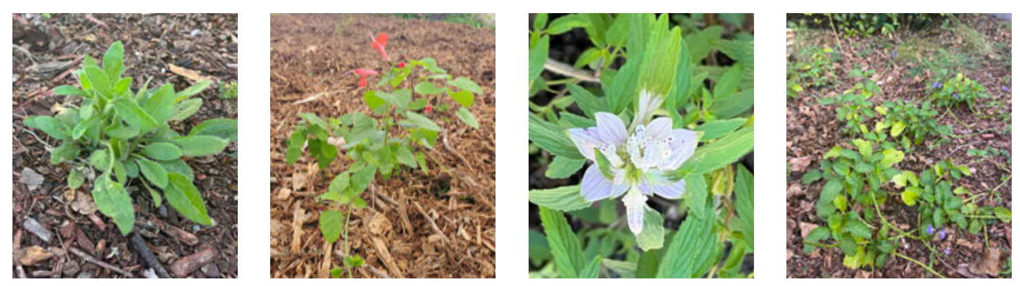
Fall seedlings (Left to right): Black-eyed Susan, Tropical sage, Spotted beebalm and Blue porterweed

Twenty-six of the schools received a spring shipment, which included eight Black-eyed Susans ( Rudbeckia hirta ), seven Oblongleaf twinflower ( Dyschoriste oblongifolia ), 15 Tropical sage ( Salvia coccinea ) (5 of each color: red, white, pink), six Leavenworth's tickseed ( Coreopsis Leavenworthii ), and four Spotted beebalm ( Monarda punctata ). The cost of plants and shipping was $50 per school, for a total of $1,500 in the fall and $1,300 in the spring.