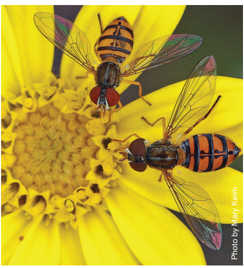
Flower flies on Silver-leaved aster

Tracy's silver-leaved aster spreads from rhizomes to make a dense groundcover and has flowers over 1 inch across on the tips of branched stems with short, appressed leaves. This variety, with its ability to spread, can make a very pleasing silvery grass-like groundcover over time. Sandhill silver-leaved aster