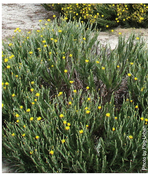
Silver-leaved aster in a landscape setting

Silver-leaved aster is best suited for zones 8A–11.